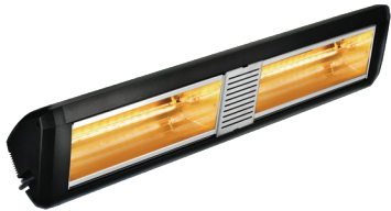
ATC Sienna 4000W Infrared Heater Black