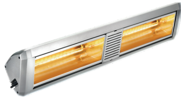
ATC Sienna 4000W Infrared Heater Silver