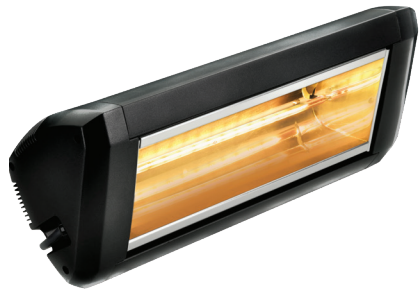
ATC Sienna 2200W Infrared Heater Black