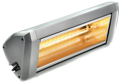
ATC Sienna 2200W Infrared Heater Silver